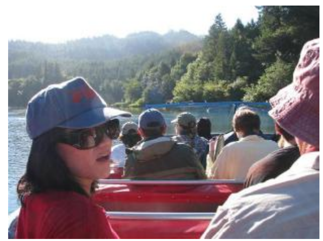
The group headed up the Roque River.