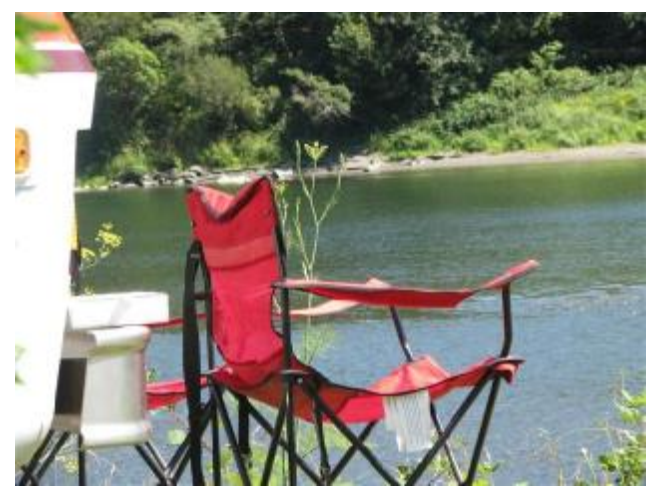
......but, was this the chair reserved for YOU?

Editor's note : All of the people in these pictures are identified in the Photo Album for the rally located on the club's website. Here is the link to these and many more pictures: <u>http://www.fmcowners.com/mbbs22/photos/photo-thumbnails.asp?albumid=111</u>