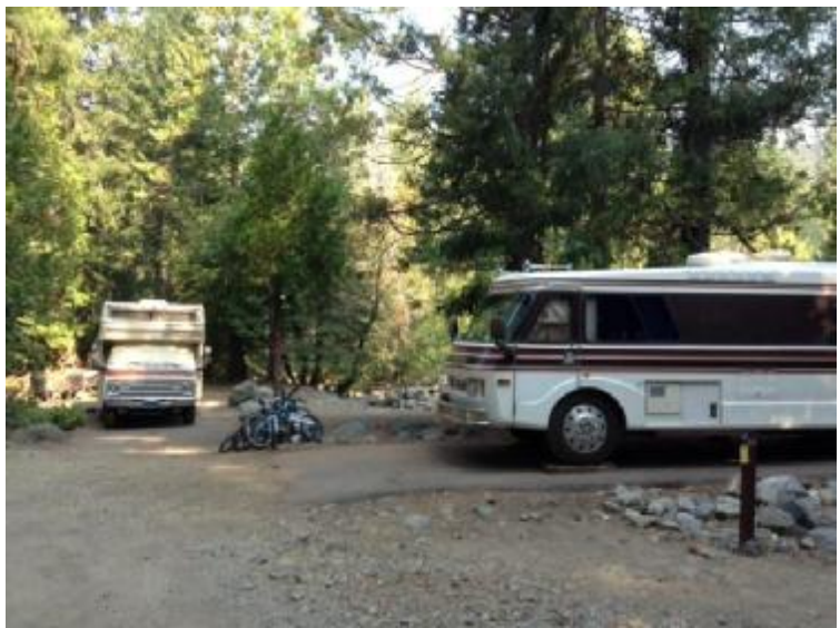
The best spots

Some of the group took to fishing at the lake, though not with much success. Others, rested and