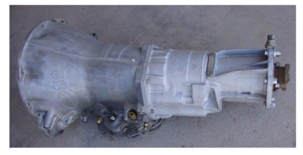
Modified HD transmission with Overdrive.