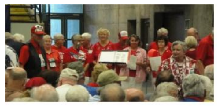
The Frustrated Maestro's

Activities that went on were breakfast every morning while being entertained by the Frustrated Maestros-South Central chapter. There is a Frustrated Maestros chapter in every one of the Geographical Area Groups except for the International Area.