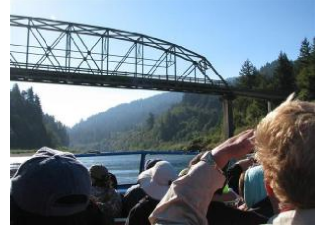
The river flowed over the deck of this bridge in the year of the highest recorded flow.