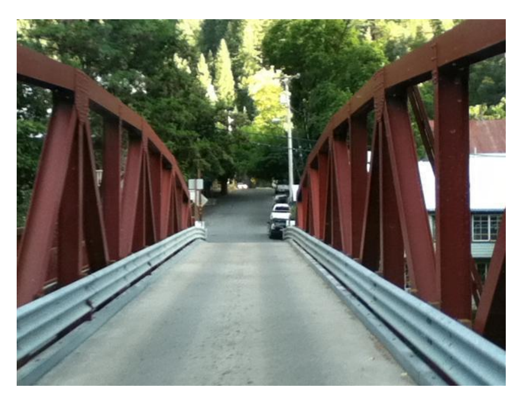
Crossing the bridge in Downieville on the way to Sierra City – yes the coach fit!