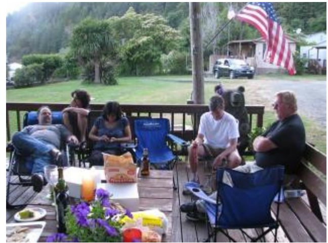
Snacks helped the meeting progress.