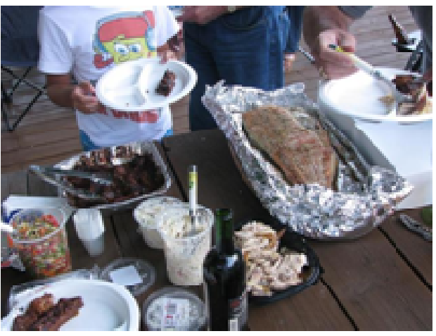
The meeting was followed by a potluck dinner.