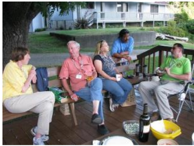
Members enjoying visiting and discussing things.