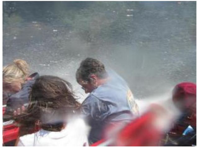
..... and sometimes it got a little wet in the rear!!!