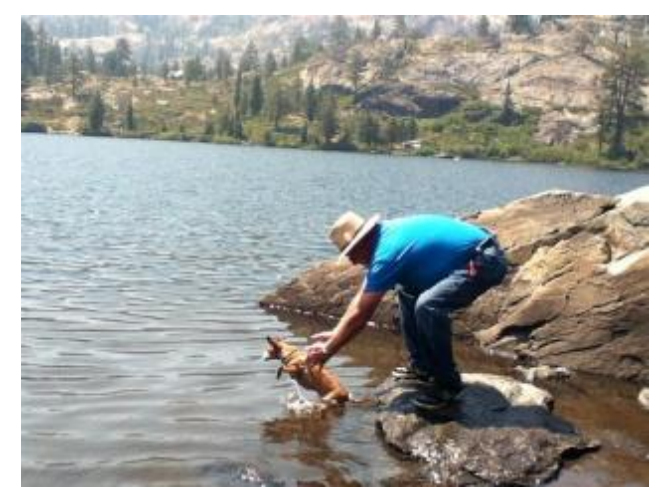
Teaching Baby to swim!

Some of the group took to fishing at the lake, though not with much success. Others, rested and