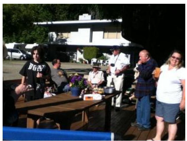
Young and mature attended the meeting.