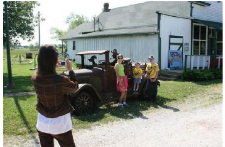
Are you in this picture?