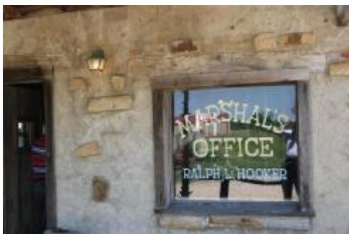
The Marshall may.....