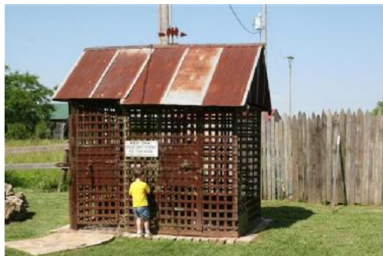
..... put you in jail if you don't behave